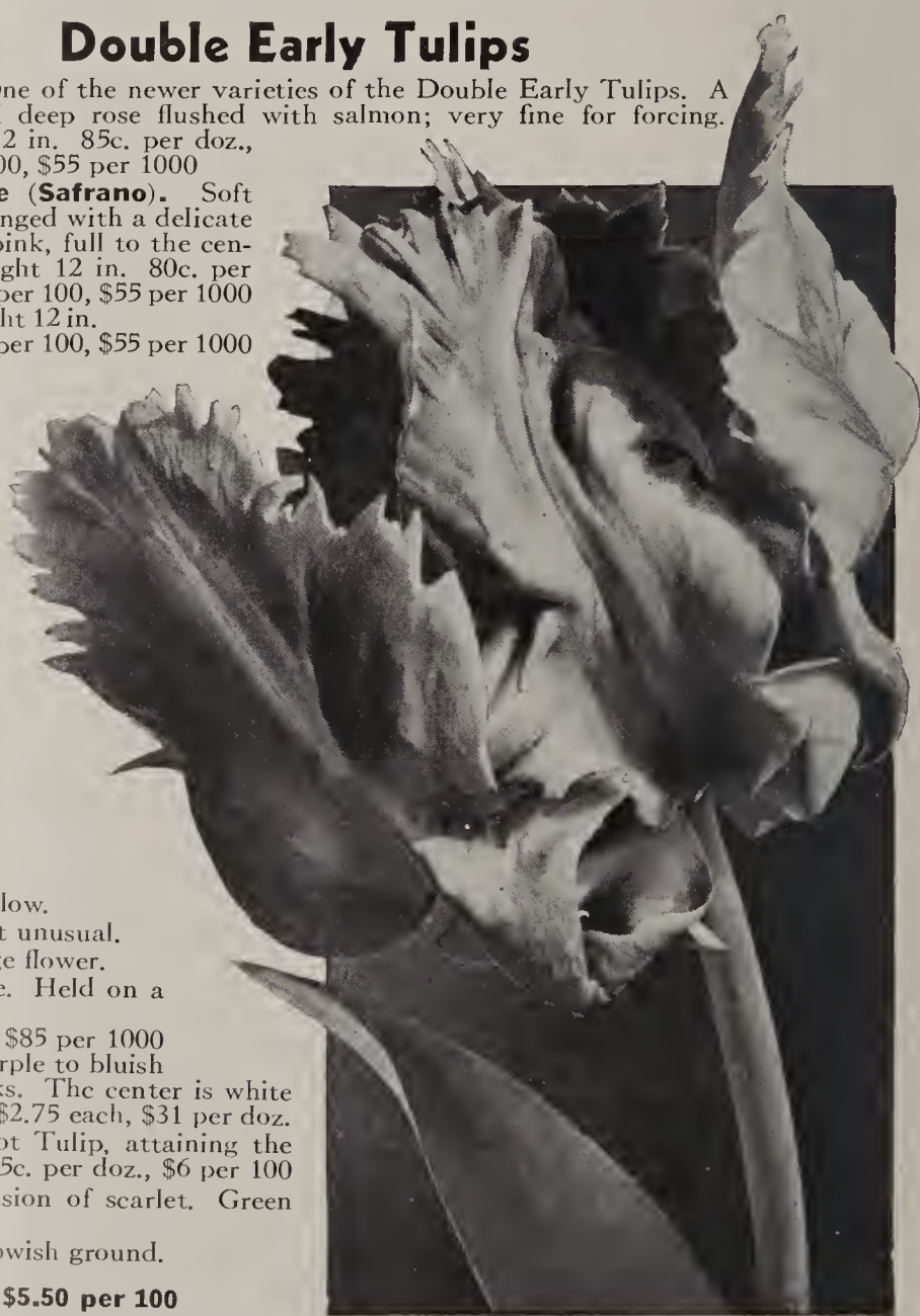
Parrot Tulip, Fantasy

* COLLECTION—20 bulbs each * variety (100 bulbs in all), $6.50